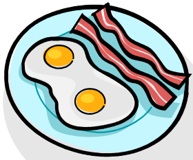
Eggs and bacon

Try and keep a food diary on Saturday or Sunday e.g. breakfast