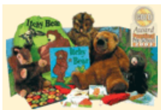
'Itchy Bear' Story Sack

Story Sacks are a fantastic, interactive resource that brings a story to life. Each sack contains the story book, puppets, objects linked to the story, games and non fiction books linked to the theme.