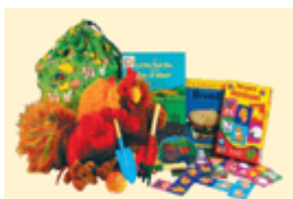
'Little red Hen' Story Sack