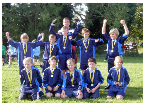
The 'A' Team