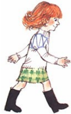
Katie Morag By Mairi Hedderwick