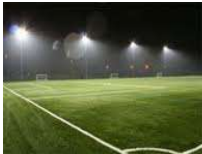
All weather flood lit sports pitch!