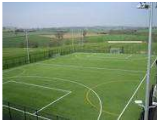
Several football pitches